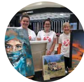
Volunteers promoting the Hub at Riccarton Mall.